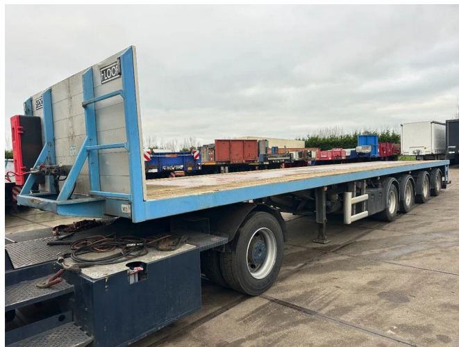
Floor 2 AXLE STEERING an 2 LIFT AXLE