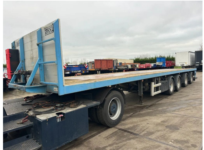
Floor 2 AXLE STEERING an 2 LIFT AXLE