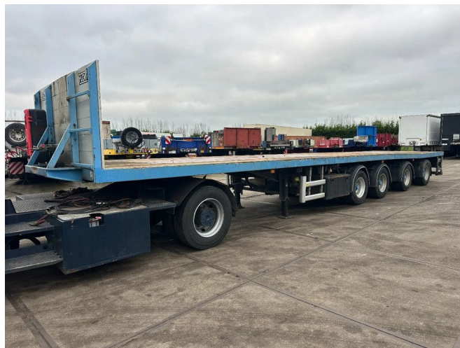
Floor 2 AXLE STEERING an 2 LIFT AXLE