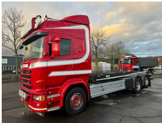
Scania R450 6X2 VDL 18T CABLE RETARDER EURO 6 TÜV...