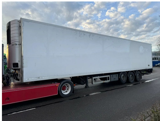
TECNOKAR CARRIER VECTOR 1550 3X SAF AXLE