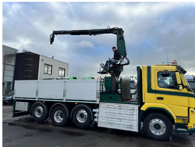
Volvo FM 460 8X2 - EURO 6 + KENNIS 14.000-R ROLLER - ...