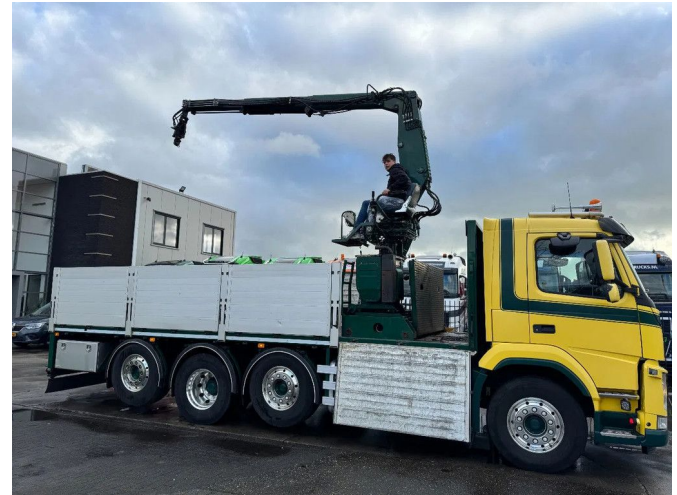
Volvo FM 460 8X2 - EURO 6 + KENNIS 14.000-R ROLLER - ...

• Air conditioning • Air horn • Aluminium fuel tank • Anti-lock braking system • Anti-lock braking system • Central