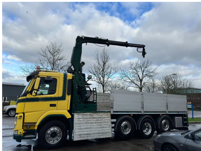
Volvo FM 460 8X2 - EURO 6 + KENNIS 14.000-R ROLLER - ...

heavy duty engine brake • Radio/CD player • Remote central locking • Reversing camera • Speed limiter • Spoilers • Spotlights • Toolbox • Twin fuel tank • Visor