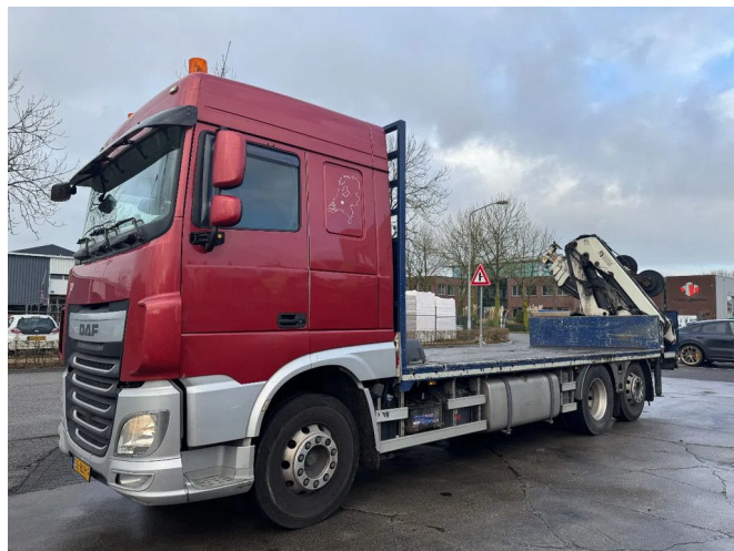
DAF XF 510 6X2 EURO 6 + HIAB 166 HI PRO + REMOTE C...