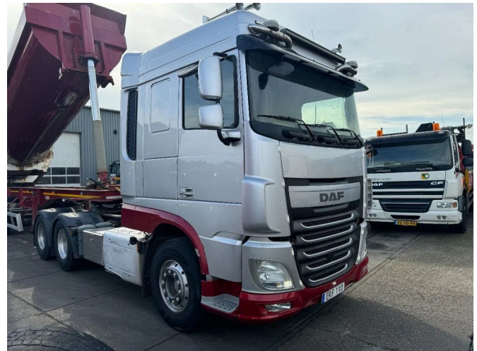
DAF XF 510 6X4 EURO 6 HYDRAULIC