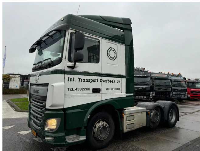
DAF XF 460 6X2 - EURO 6 + LIFT AXLE + STEERING AXLE