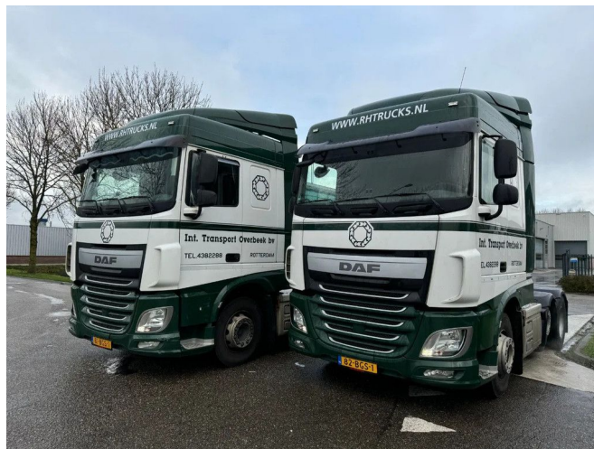
DAF XF 460 6X2 - 2 UNITS!! - EURO 6 + LIFT AXLE + STEE...