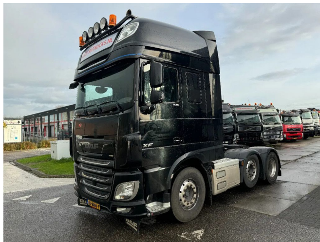
DAF XF 460 6X2 EURO 6 STEERING AXLE HYDRAULIC