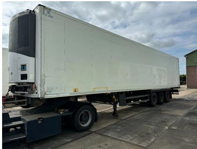
Schmitz Cargobull THERMO KING SLXE200 BPW AXLE