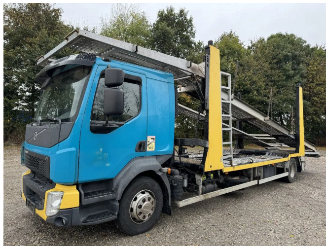
Volvo FL 280 4X2 - *TIK IN DE MOTOR* + EURO 6 + WINCH