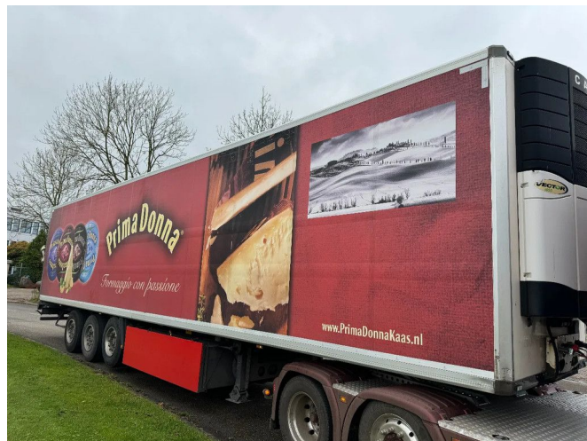
Krone SD - CARRIER VECTOR 1850 + 3X SAF AXLE + LIFT...