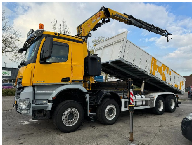
Mercedes-Benz Arocs 4448 8X4 + EURO 6 + FASSI F315 + ...