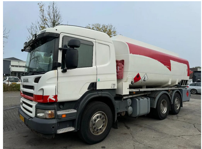
Scania P400 6X2 - EURO 5 + 3 CAMBER + LIFTING AXLE