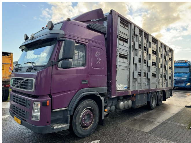
Volvo FM 300 6X2 - LIVE STOCK - 4 LAYERS MOVING FLO...