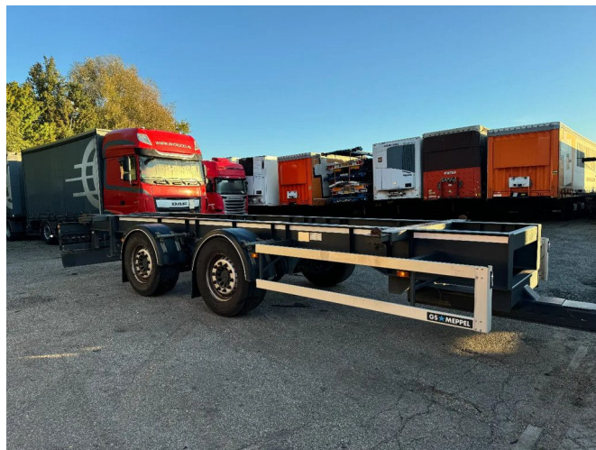
GS MEPPEL AN-1800 C 2X SAF AXLE