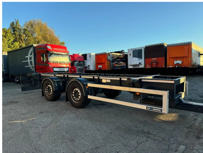
GS MEPPEL AN-1800 C 2X SAF AXLE