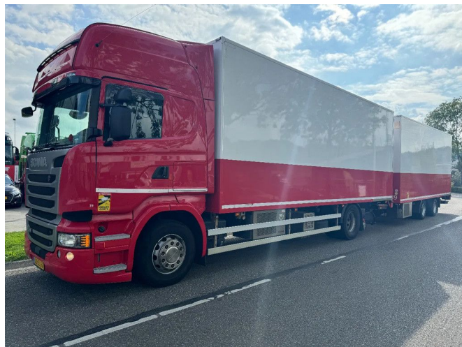
Scania R410 4X2 + CARRIER TRS + BURG HANGER + 2X ...