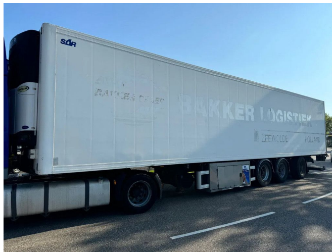
Sor 3 AXLE + CARRIER 1850 D/E