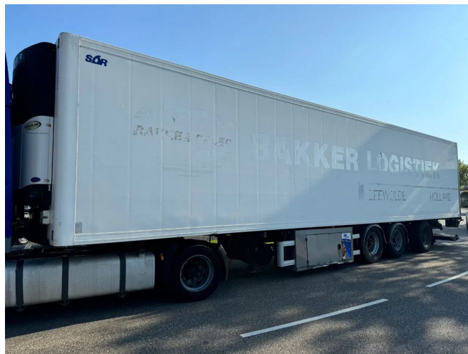
Sor 3 AXLE + CARRIER 1850 D/E