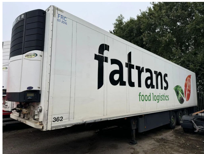
SCHMITZ CARGOBULL CARRIER 1850 MT D/E SAF AXELS