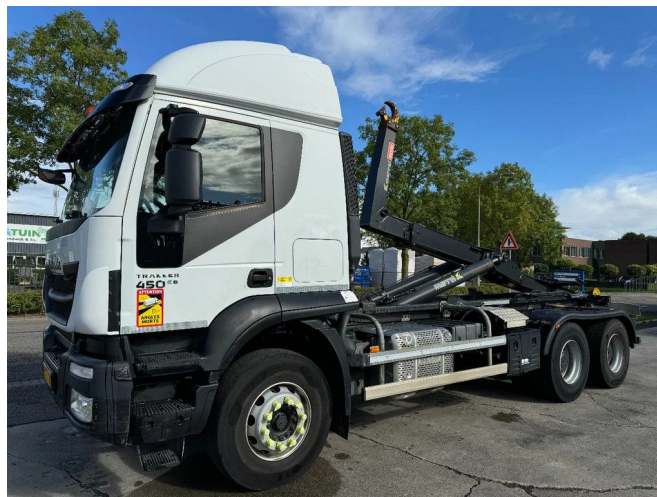
Iveco Stralis 450 6X2 - EURO 6 + MARREL HOOK