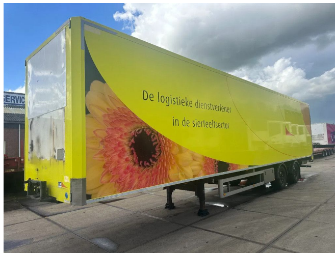
H.T.F. 1e AS LIFT 2e STUUR 13,5 X 2,5 X 2,74M