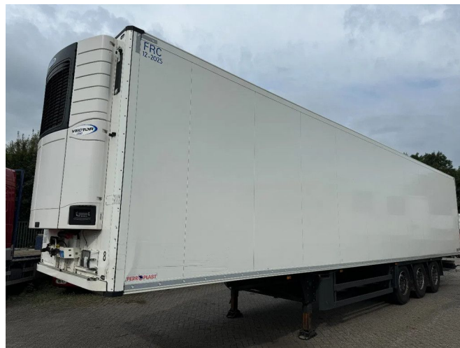
Schmitz Cargobull SCB S3B - 3 AXLE - CARRIER VECTOR ...