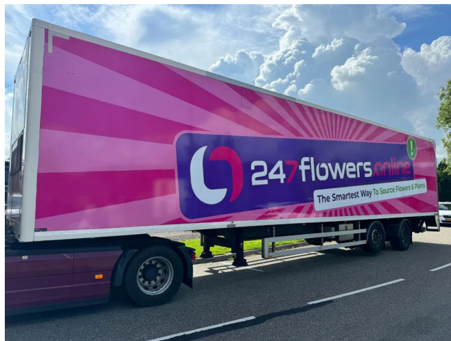
H.T.F. 1e AS LIFT 2e STUUR 13,5 X 2,5 X 2,74M