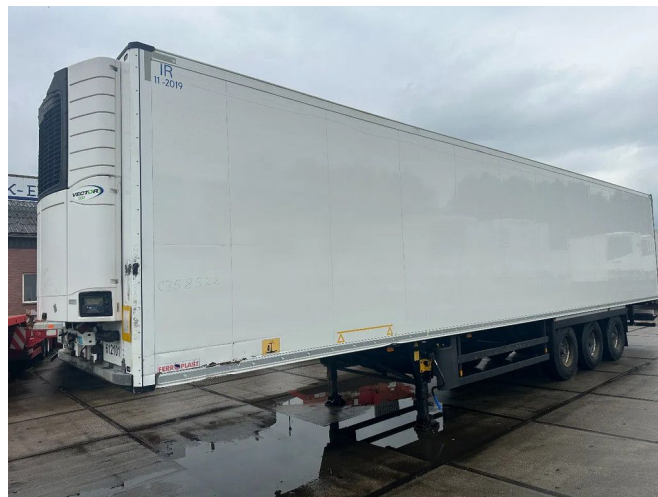
Schmitz Cargobull CARRIER 1550 D/E