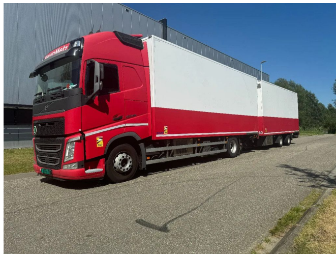
Volvo FH 460 4X2 TRS COOLING + BURG 2 AXLE HANGER