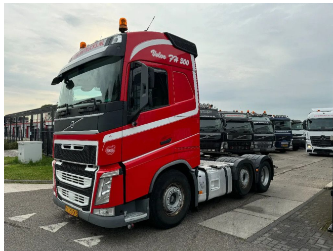
Volvo FH 500 6X2 AUTOMATIC STEERING AXLE