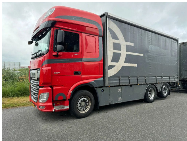
DAF XF 480 6X2 EURO 6 2018 AUTOMATIC