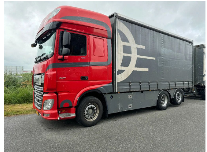
DAF XF 480 6X2 EURO 6 2018AUTOMATIC