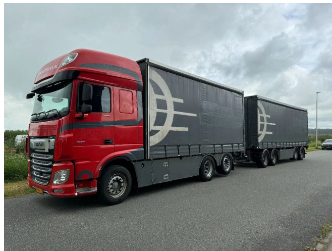
DAF XF 480 6X2 EURO 6 + M&V HANGER