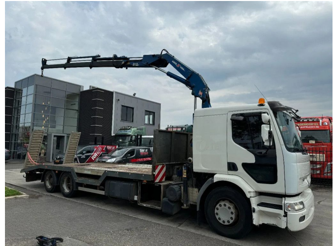
Renault Premium 370 6X2 + AMCO VEBA V812 3S CRANE +...