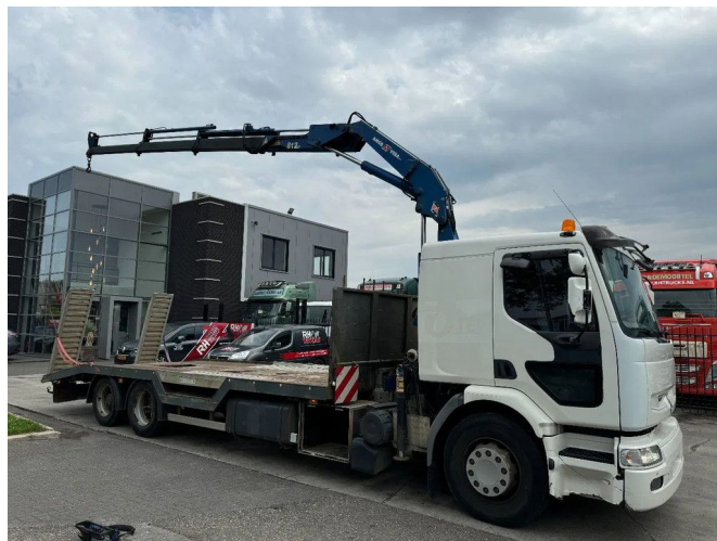
Renault Premium 370 6X2 + AMCO VEBA V812 3S CRANE +...