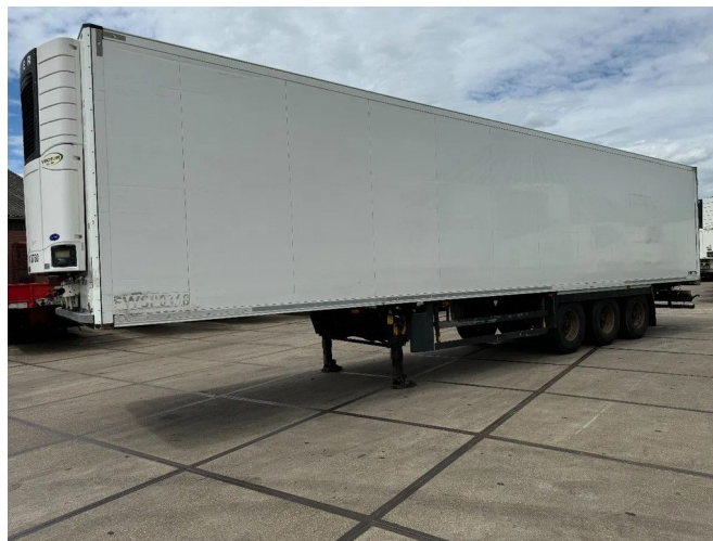
Schmitz Cargobull CARRIER 1850 MT D/E SAF AXELS