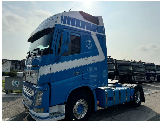
Volvo FH 460 4X2 - EURO 6 + ADR