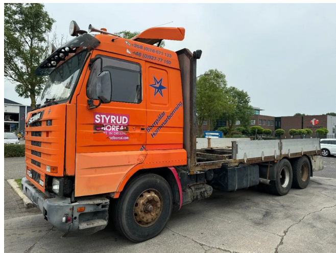
Scania R143-500 V8 6X4 + MANUAL GEARBOX