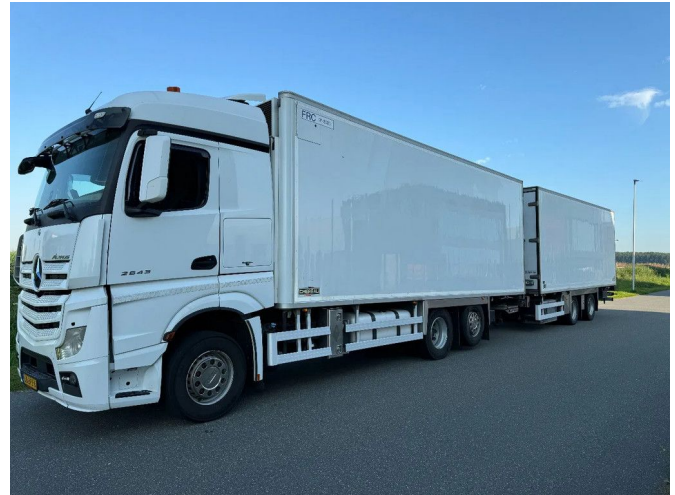
Mercedes-Benz Actros 2643 6X2 - EURO 6 + CHEREAU HA...