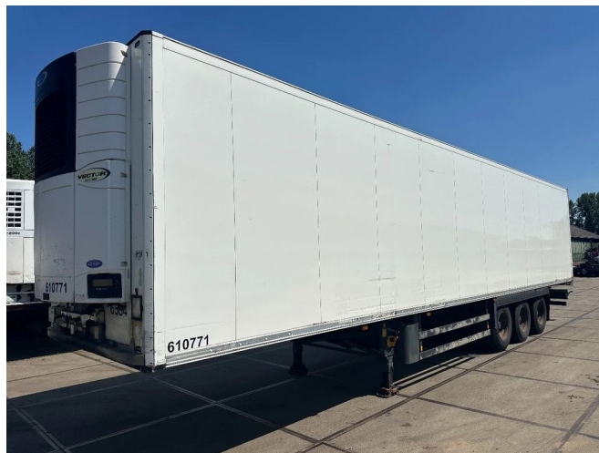
Schmitz Cargobull CARRIER 1850 MT D/E SAF AXELS