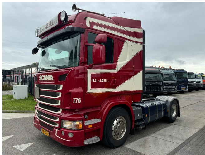
Scania R440 4X2 + ADR + EURO 5 + AUTOMATIC