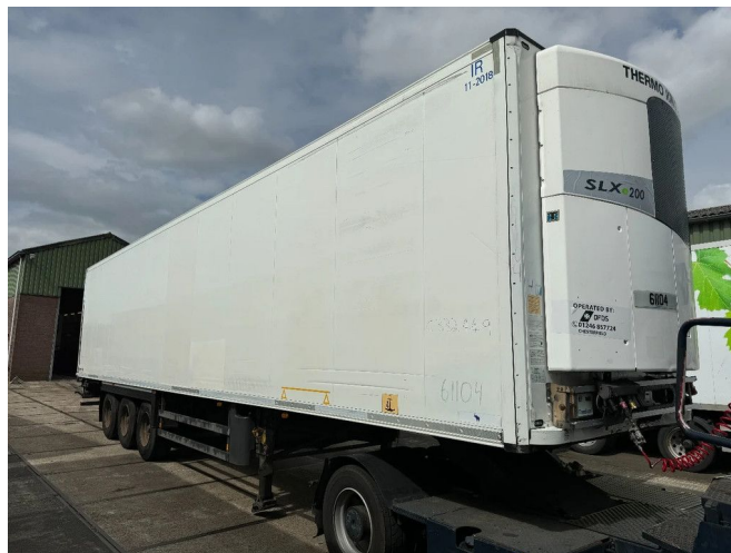
Schmitz Cargobull 15 UNITS THERMO KING SLXE200 BPW...