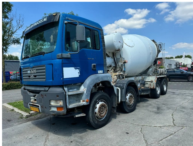
MAN TG 360 A CIFA 10 CBM FULL STEEL MANUAL