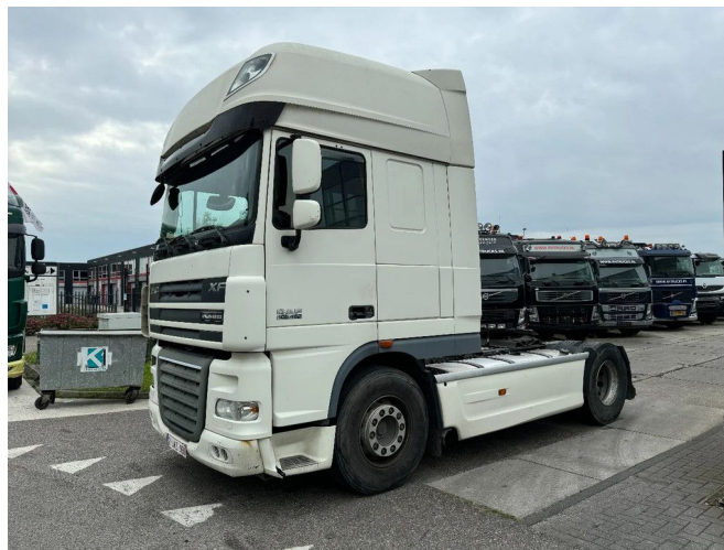
DAF XF 105.460 4X2 EURO 5 HYDRAULIC