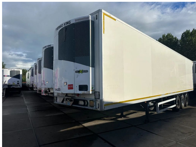
Montracon 10 X THERMO KING SLX 200 -13,4X2,5X2,6 ME...