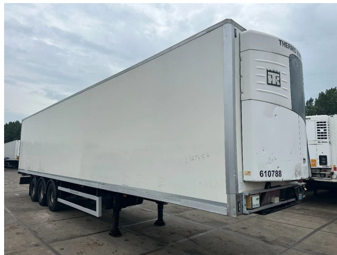
Montracon THERMO KING SLX 200 BPW DRUM BRAKES