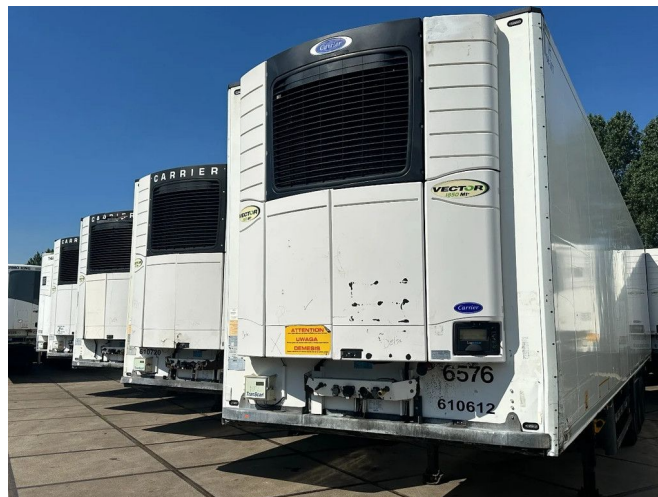
Schmitz Cargobull 40 X CARRIER 1850 MT D/E SAF AXELS