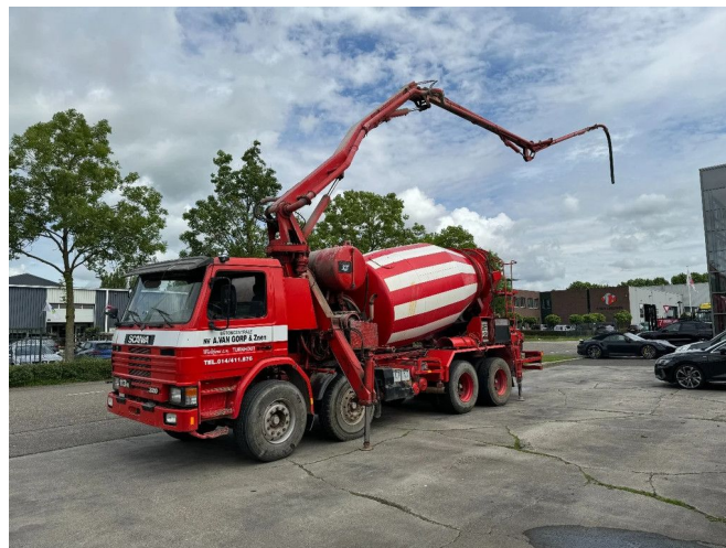
Scania P113-320 8X4 MIXER 9M3 + 24M PUMP + REMOTE...